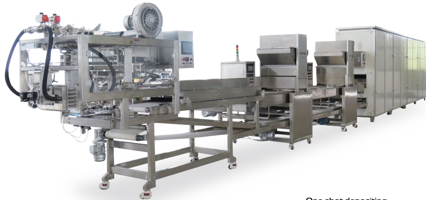
One shot depositing